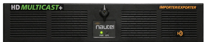
HD MultiCast+ Importer/Exporter

*The program is currently focused on US and Canadian installations. Talk to your Nautel representative if you would like to consider a trial in other locations. Other conditions apply.